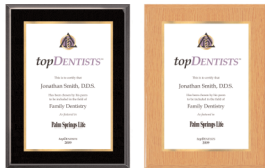
Plaque Dimensions: 10.5" x 13" Also available in black or lighter wood panel.

The 2009 edition of topDENTISTS will be excerpted in Palm Springs Life Magazine in its December 2009 issue. A topDENTISTS plaque is available to those outstanding dentists who have been selected by their peers for inclusion in the 2009 edition of topDENTISTS . Each plaque consists of a gold-rimmed certificate attesting to the dentist's selection by his or her peers, and features the topDENTISTS logo, dentist's name, specialty, magazine's logo and 2009 inclusion date. The metallic certificate is mounted on a handsome wood panel.