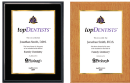
Plaque Dimensions: 10.5" x 13" Also available in black or lighter wood panel.

The inaugural edition of topDENTISTS 2009 will be excerpted in Pittsburgh Magazine in its August 2009 issue. A topDENTISTS plaque is available to those outstanding dentists who have been selected by their peers for inclusion in the 2009 edition of topDENTISTS . Each plaque consists of a gold-rimmed certificate attesting to the dentist's selection by his or her peers, and features the topDENTISTS logo, dentist's name, specialty, magazine's logo and 2009 inclusion date. The metallic certificate is mounted on a handsome wood panel.