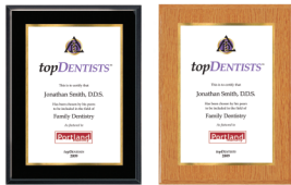
Plaque Dimensions: 10.5" x 13" Also available in black or lighter wood panel.

The inaugural edition of topDENTISTS 2009 will be excerpted in Portland Monthly in its September 2009 issue. A topDENTISTS plaque is available to those outstanding dentists who have been selected by their peers for inclusion in the 2009 edition of topDENTISTS . Each plaque consists of a gold-rimmed certificate attesting to the dentist's selection by his or her peers, and features the topDENTISTS logo, dentist's name, specialty, magazine's logo and 2009 inclusion date. The metallic certificate is mounted on a handsome wood panel.